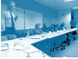
Meeting with African delegates concerning our work with Human/Sex Trafficking

“helps us in our weakness” (Romans 8:26). The Holy Spirit gives us strength to walk with Jesus, bash sin out of our lives, grow in God’s image, and lead in ministry (Eph. 4:11-16). Leaders are empowered to help others develop their faith and Christians are led by the Spirit to share God’s agape with others. A healthy church is one where the